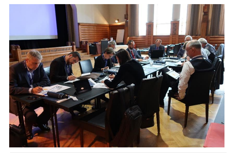
Pictured above: The participants of the CEPOL Presidency Activity gathered in GLO Hotel Art in Helsinki. Pictured below: During the activity, the participants were divided into smaller working groups. Pictured is one of these groups, imagining the future of policing.