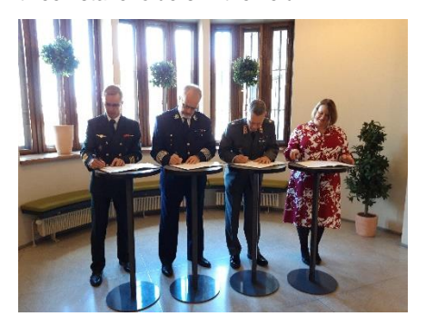
Agreement for the Finnish Centre of Expertise in Comprehensive Crisis Management was signed in September.

was formalised with a signing of an agreement. The agreement for the Finnish Centre of Expertise in Comprehensive Crisis Management was published during the Comprehensive Crisis Management Seminar in September. The centre of expertise aims at developing comprehensive crisis management as a concept and at increasing knowledge about it. The centre of expertise also enhances cooperation between stakeholders in the field.